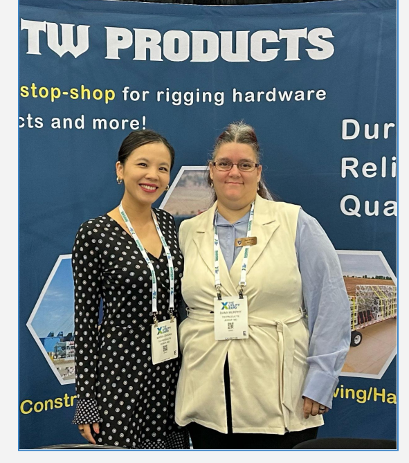
TW Products at TUE on the 26th of September in Louisville, KY

show on September 29-30 in Chattanooga, TN. As its name implies, the Tennessee Tow Show focuses on the towing and transport industries, where our products have already established a significant presence.