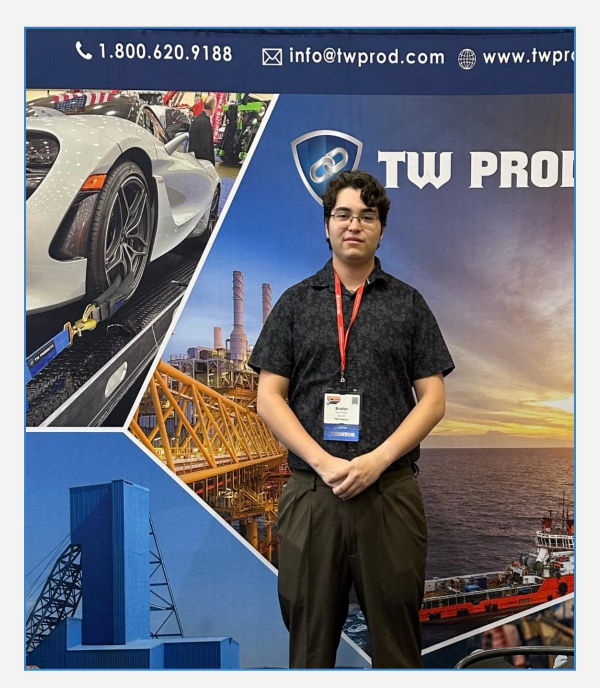
TW Products at the Tennessee Tow Show on the 29th of September in Chattanooga, TN